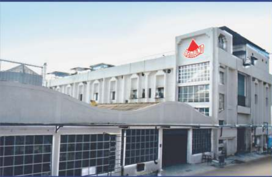
◀ Gurgaon Factory