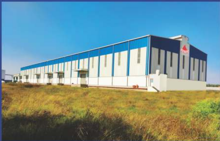
Gohana ▶ Factory